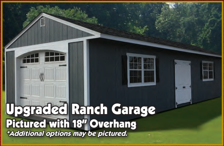
Upgraded Ranch Garage Pictured with 18" Overhang *Additional options may be pictured.