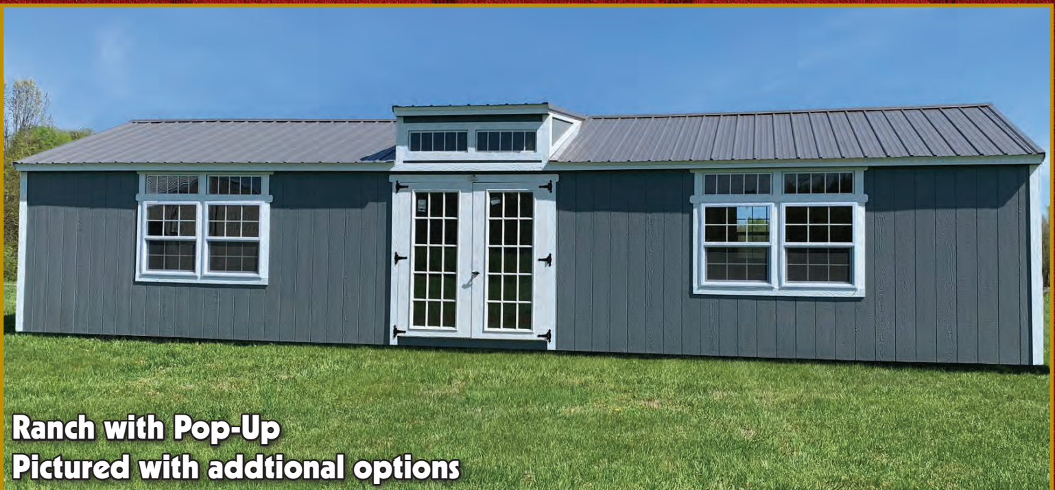
Ranch with Pop-Up Pictured with additional options