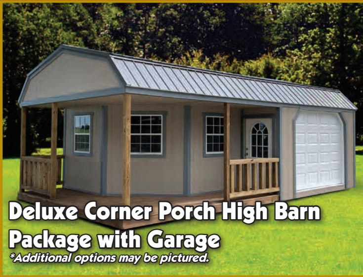
Deluxe Corner Porch High Barn Package with Garage *Additional options may be pictured.