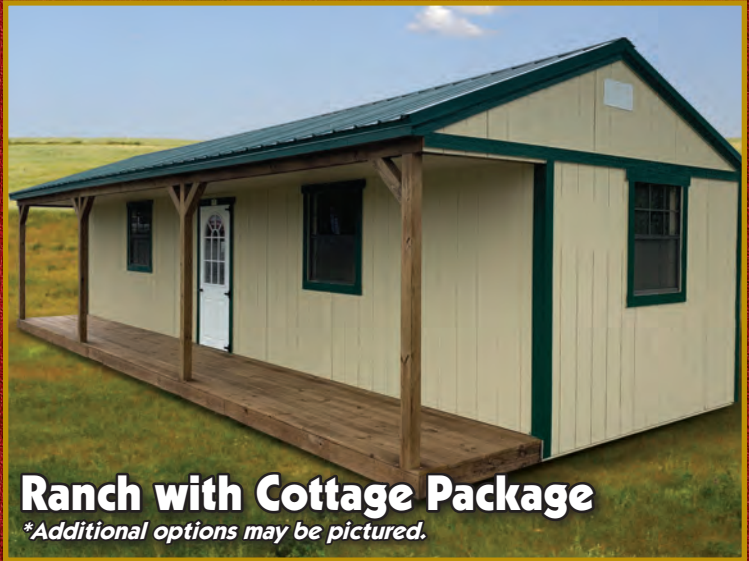
Ranch with Cottage Package *Additional options may be pictured.