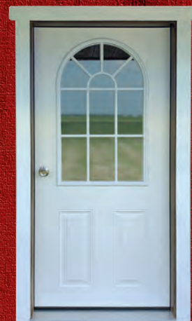
11 Lite Prehung Door