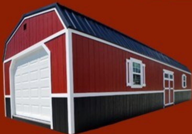
HIGH-BARN STYLE ROOF *Shown with optional accessories

Available in LP® SmartSide® or 29 Gauge Metal