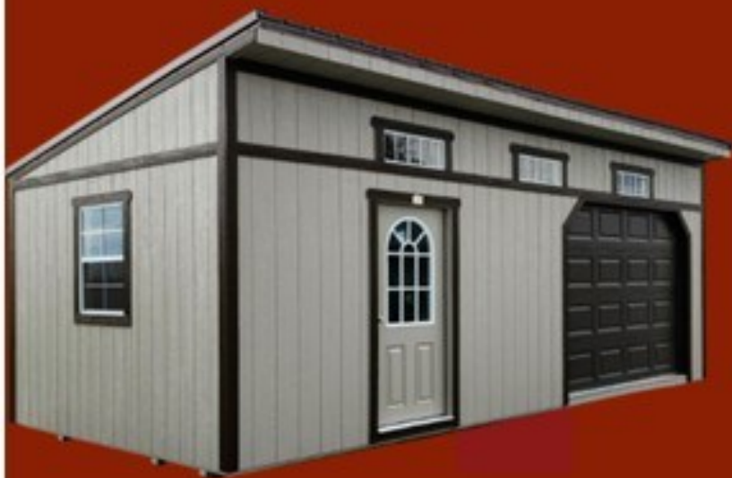
LP® SINGLE-SLOPE STYLE ROOF *Shown with optional accessories and a 9' x 7' garage door.