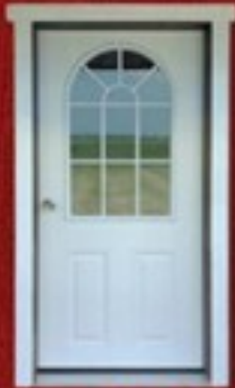
11-LITE PRE-HUNG DOOR