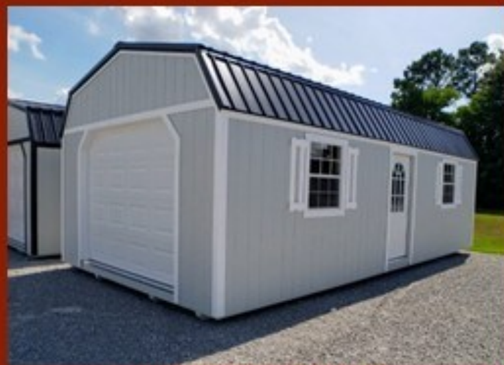
HIGH BARN STYLE ROOF *Shown with optional accessories

Premium Garages are available in ranch or high-barn roof style and come standard with: 12" on center, 2" x 6" floor joists / (1) solid or 11-lite pre-hung door / (2) large windows (white) / (1) 9' x 7' overhead garage door / painted trim / 4' loft