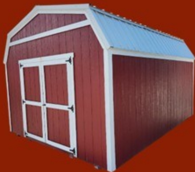
LP® HIGH-BARN STYLE ROOF *Shown with optional accessories