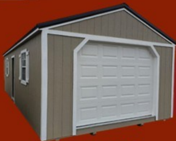
RANCH STYLE ROOF *Shown with optional accessories

Premium Garages are available in ranch or high-barn roof style and come standard with: 12" on center, 2" x 6" floor joists / (1) solid or 11-lite pre-hung door / (2) large windows (white) / (1) 9' x 7' overhead garage door / painted trim / 4' loft