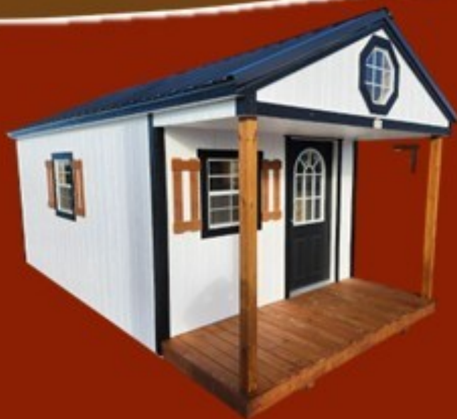
RANCH STYLE ROOF

LP Premium Porch Buildings are available in a ranch or high-barn roof style and come standard with: a solid or 11-lite pre-hung door / (2) large windows (white) / vent / painted trim /4' loft.