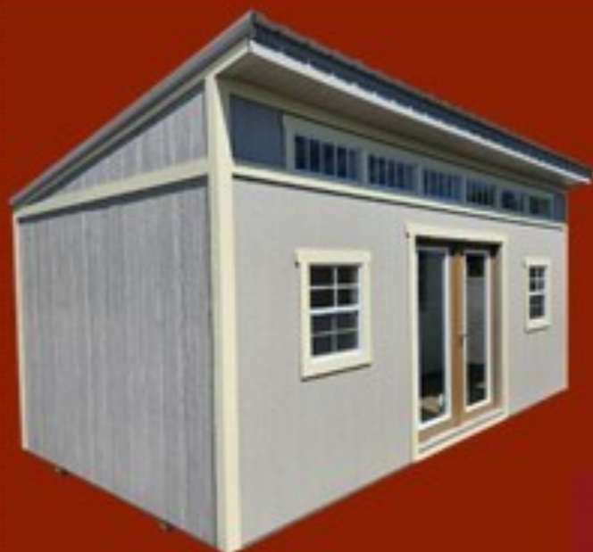
LP® PREMIUM SINGLE-SLOPE ROOF *Shown with optional accessories

Premium Buildings are available in a ranch, high-barn, and single-slope roof style, and come standard with: 72" double doors / (1) medium window / vent / painted trim / 4' loft.