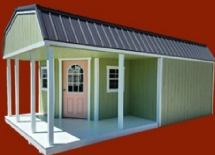
CORNER PORCH PACKAGE