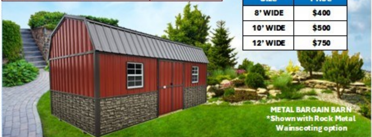
METAL BARGAIN BARN *Shown with Rock Metal Wainscoting option