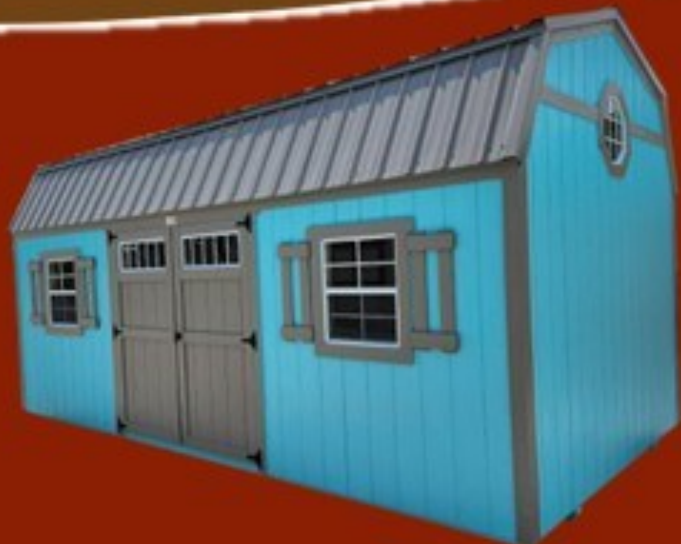
LP® HIGH-BARN STYLE ROOF *Shown with optional accessories