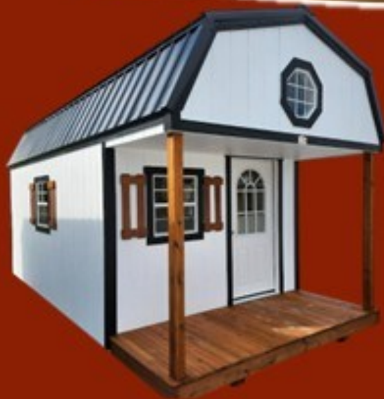
HIGH-BARN STYLE ROOF