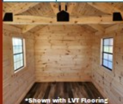
*Shown with LVT Flooring