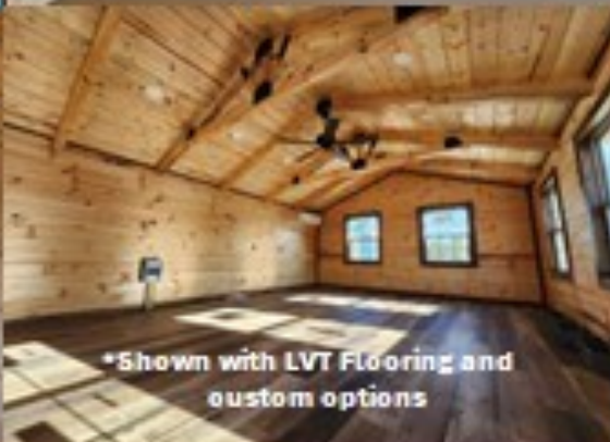
*Shown with LVT Flooring and custom options