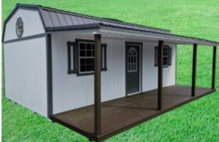
Premium Cottage Porch

Weaver Portable Buildings 7908 New Highway 68 W Elkton, KY 42220 270-885-5603