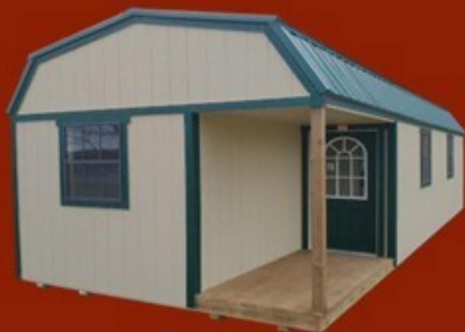
HALF PORCH PACKAGE

LP Premium Porch Buildings are available in a ranch or high-barn roof style and come standard with: a solid or 11-lite pre-hung door / (2) large windows (white) / vent / painted trim /4' loft.