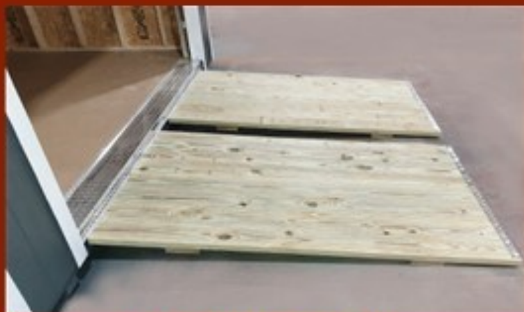
WOOD RAMP KIT 48" x 72"