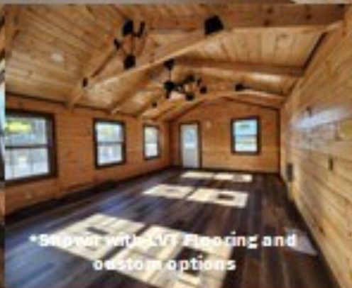
*Shown with LVT Flooring and custom options