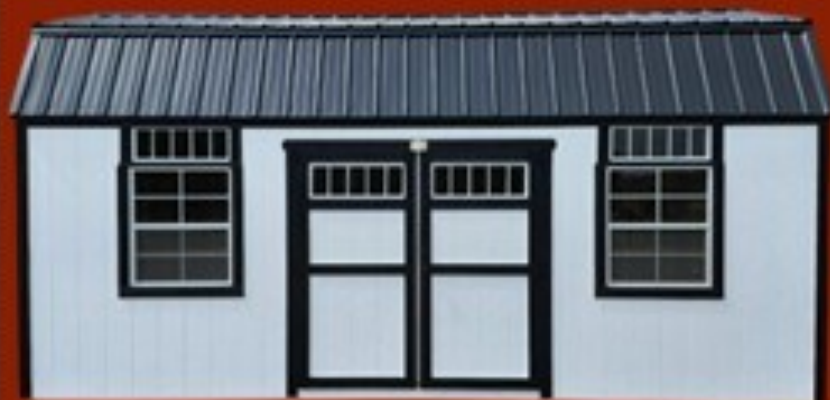
LP® PREMIUM HIGH-BARN STYLE ROOF *Shown with optional accessories

Available in LP® SmartSide® or 29 Gauge Metal