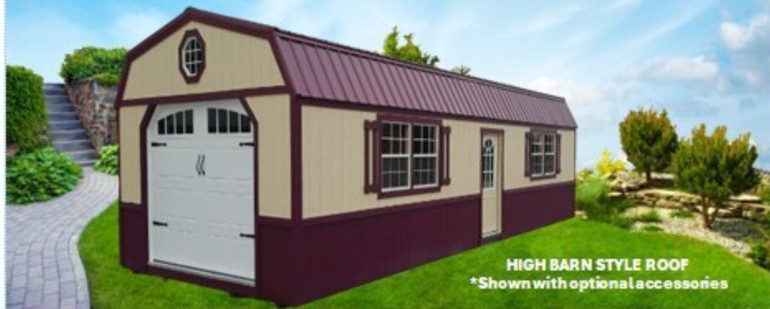
HIGH BARN STYLE ROOF *Shown with optional accessories