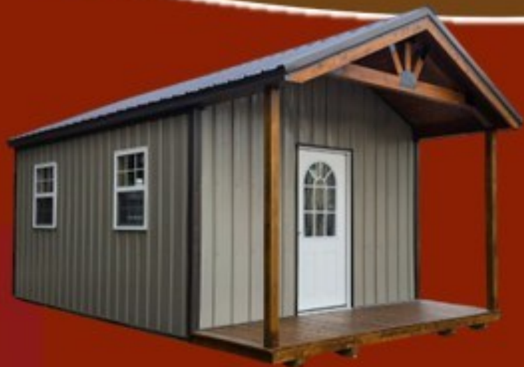
METAL RANCH STYLE ROOF *Shown with a 4' Porch

Available in LP® SmartSide® or 29 Gauge Metal