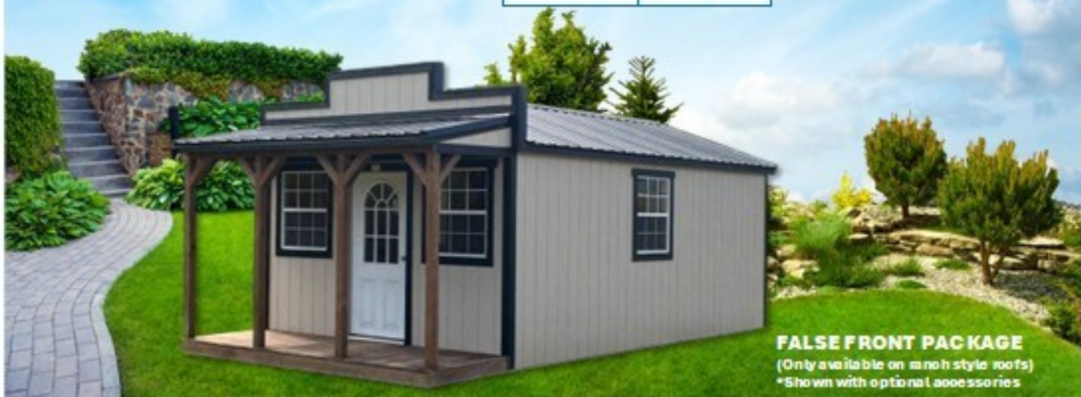
FALSE FRONT PACKAGE (Only available on mansh style roofs) *Shown with optional accessories