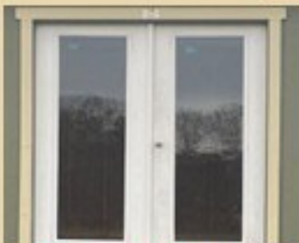
PRE-HUNG FRENCH DOORS