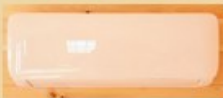
9k or 12k HVAC UNIT