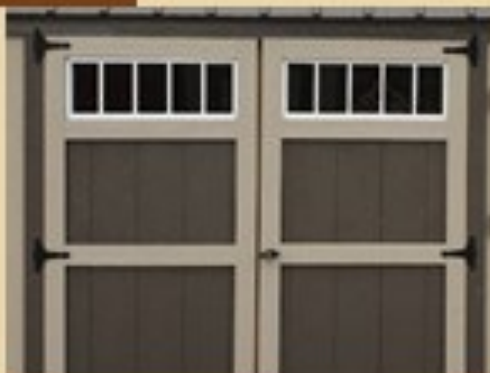
72" DOUBLE DOOR WITH TRANSOM WINDOWS