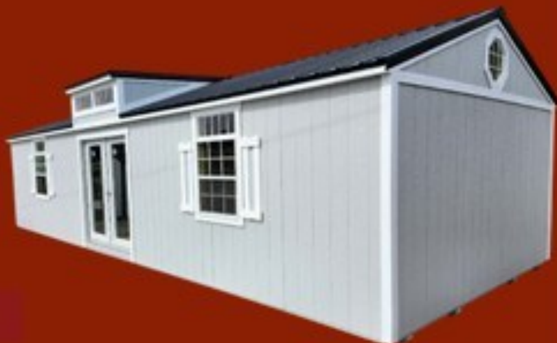
LP® PREMIUM RANCH STYLE ROOF *Shown with optional accessories